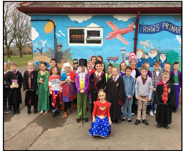
Y3 enjoyed dressing up as their favourite characters on World Book Day

Please remember that all school meals should be paid for in advance using the Parentpay system. We cannot allow debts to mount up because this has an impact on the school's budget. If you have any difficulties paying for dinners or think your child may be entitled to free school meals, please contact us.