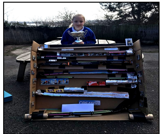
The winning entry in the inter-schools marble run competition.

National tests for Y2 - Y6 pupils will be held between 2nd - 9th May. Please try to avoid taking holidays at this important time of year. Thank you