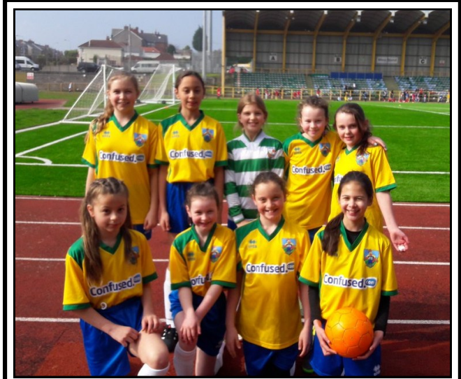
Our girls' football team played in their first tournament at Jenner Park