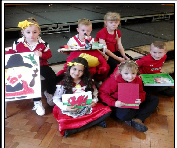
Some of our Eisteddfod winners Da iawn bawb!

National tests for Y2 - Y6 pupils will be held between 3rd - 10th May. Please try to avoid taking holidays at this important time of year. Thank you